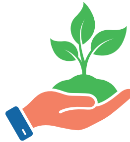
Building new amenities (e.g., a new community garden at Deer Valley)