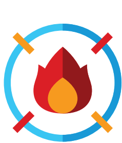
Construction of Fire Hall 3