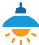
Future infrastructure growth projects approved by Council to be brought forward as part of the proposed Budget 2025 (e.g., artificial turf at John Bole Athletic Park and lighting at William F. Lede Park).