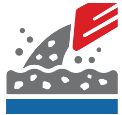
Continued focus on improving roads in Willow Park