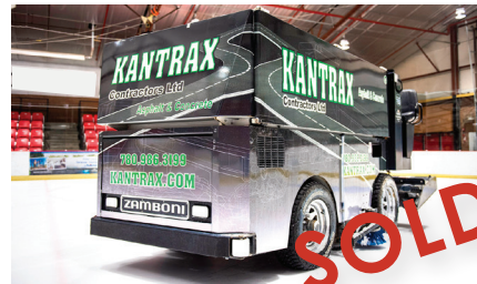
LRC Performance Arena