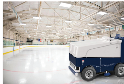
Alexandra Arena Available for the 2022-23 season