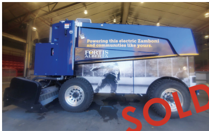
LRC Twin Arenas